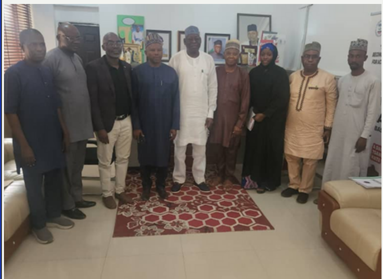
COURTESY VISIT TO THE HON. COMMISSIONER FOR HEALTH AND HUMAN SERVICES, ADAMAWA STATE, CHIEF FELIX TENGWAMI, ON 16 APRIL 2025 WITH RESPECT TO THE INSPECTION ACTIVITY.

Recommendations arising from these inspections have been duly communicated to the management of these hospitals. These inspections are conducted to ensure that these facilities meet up with the minimum standards of hospital pharmacy practice.